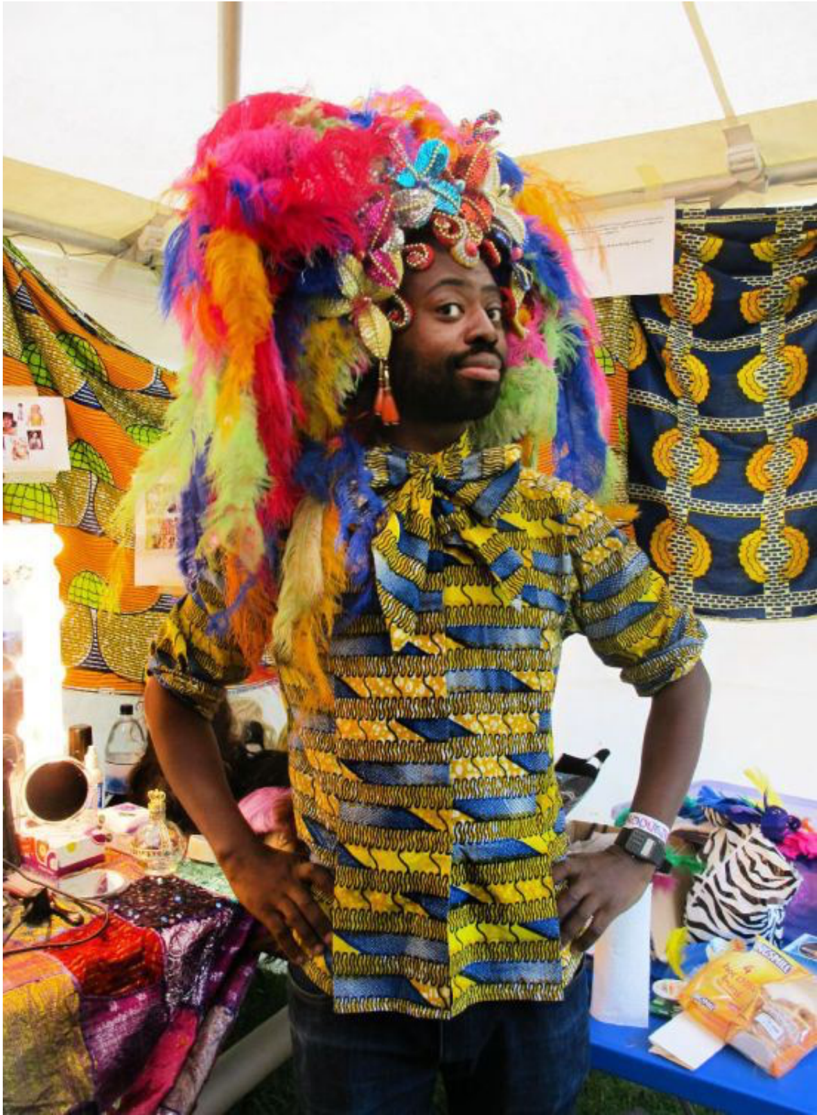
Carnaval Queen, 2012.