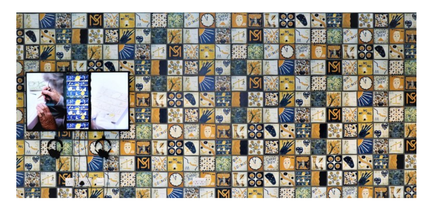
A Pattern for Progress, 2019

Location: Ground Floor Exhibition Space, Jeffrey Cheah Biomedical Centre